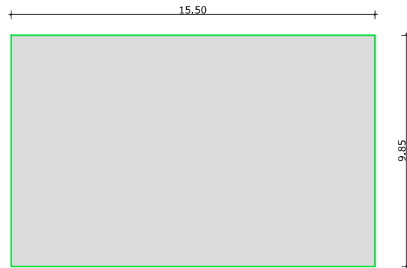
DIMENSIONES ELEVACION : 15.50 X 9.85 m